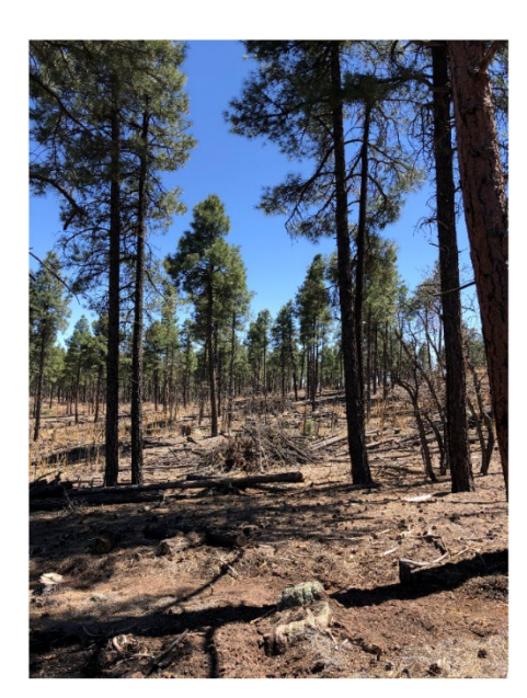
Post-thin and pile burn/adjacent fuels.