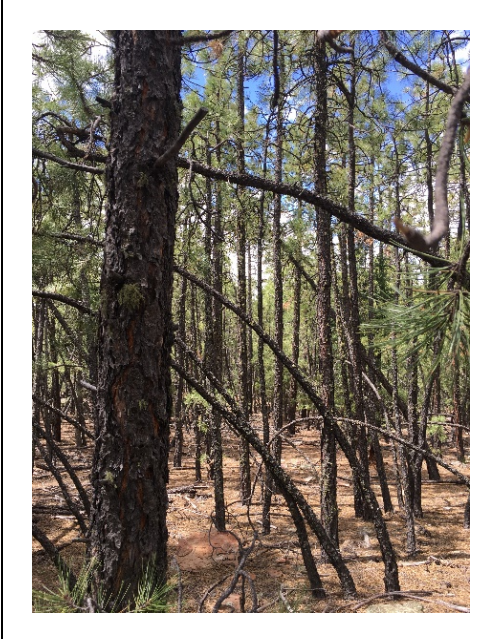
Pre-thinning typical stand.

The Llano Loco wildfire started in a 130 acre fuels reduction treatment. This 2017 project was a thin/pile with subsequent fuelwood removal, that was placed adjacent to various other cut/pile and thinning treatments totaling over 2,400 acres. These treatments had been implemented since 2015. One of the primary drivers for fuel reduction treatments in this area were to reduce large fires from human ignitions along the highly recreated forest road 376 corridor. Funding for the fuel reduction came from various sources, New Mexico State Forestry, Joint Chiefs, New Mexico Department of Game and Fish, Rocky Mountain Elk Foundation and Forest Service Hazardous Fuels funding. Pre-thin conditions were overstocking of small diameter predominately ponderosa pine. The photos below show fuels conditions before thinning, post-thin & pile burn and post wildfire.