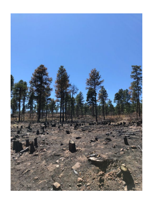
Llano Loco Wildfire effects.

As a result of fuels treatments along this busy forest roadway the Llano Loco fire was contained at 0.75 acres with ease by the Jemez Fire crew. In the 2020 season a similar human caused fire was started in this area also resulting in quick containment of the fire. With forest use at an all-time high it is important to consider strategic placement of fuels treatments to combat catastrophic wildfire from human ignitions. Fuels treatments such as these on forest road 376 will pay dividends in the long run not only in diminishing large human caused fires but also in aiding the return of natural fire to departed forest ecosystems. See Figure 1 for fire location and previous fuels treatments.