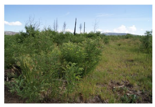
(d) Ruderal—Plot 9622