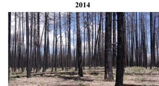
(a) Forest-Plot 9360