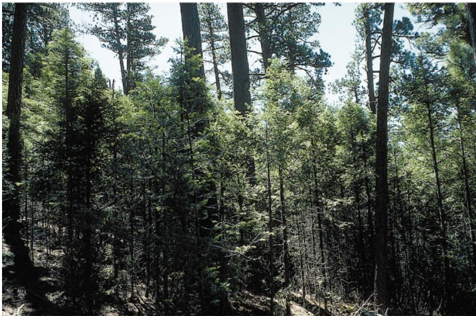
FIG. 1. Ponderosa pine forests of the American Southwest. (Top) Open ponderosa pine forest representing “typical” pre-1900 conditions, with grassy understory and surface fire activity. (Bottom) Altered ponderosa pine stand in need of restoration, showing changes in both stand structure and species composition. The dense midstory of mixed conifer trees provides ladder fuels that favor crown fire development.

port the development and implementation of a diverse range of scientifically viable restoration approaches in these forests that address the critical issues of forest heterogeneity, scientific uncertainty, and effects on wildlife. In addition, we suggest principles for ecologically sound restoration approaches. It is not our intention to emphasize a critique of any particular model, but we do present ecological perspectives on several alternative forest restoration approaches.