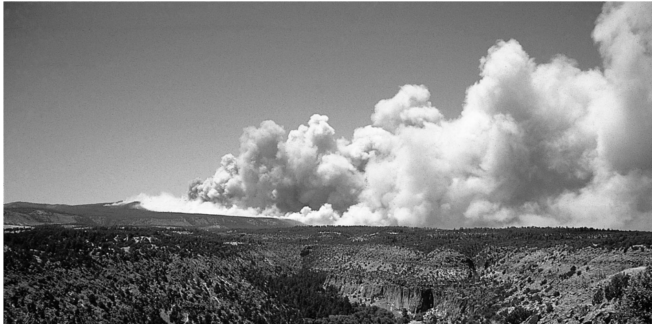
FIG. 2. View looking northwest at the Cerro Grande Fire on the afternoon of 10 May 2000 as it burned toward Los Alamos, New Mexico (USA). Similar large, stand-replacing fires are becoming increasingly common in Southwestern ponderosa pine forests.

scape scales (Cooper 1960, White 1985), with pattern shifts through time within a natural range of variability (Swetnam et al. 1999).